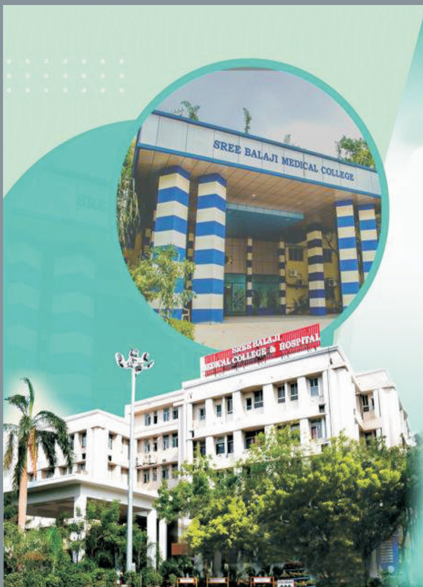
Sree Balaji Medical College & Hospital